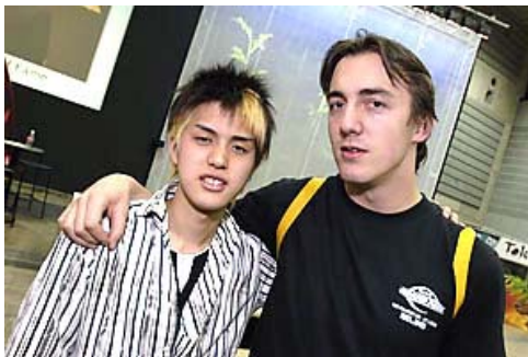
Kenji's battle against Olivier for the 2005 Player of the Year was the stuff of legend.

There is no traditional firestarter this week – the whole column more or less serves as a topic of discussion. All eyes will be on Kenji this season as he continues his assault on the record books. Can he return to form in Constructed after devoting so much time to mastering the art of the 40-card deck? Can he get the elite-class sixth Top 8 finish? Will he finally get the Top 8 monkey off his back? And where will he end up when the final chapters of his career are written? Share your thoughts on Kenji in the forums and don't forget to follow his ongoing adventures from the Tournament Center in just one week.